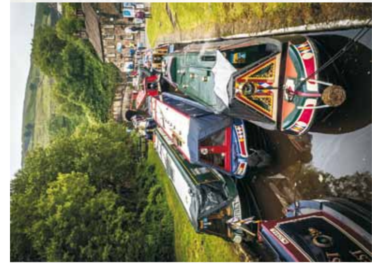
2017 Explorer Cruise at Tunnel End